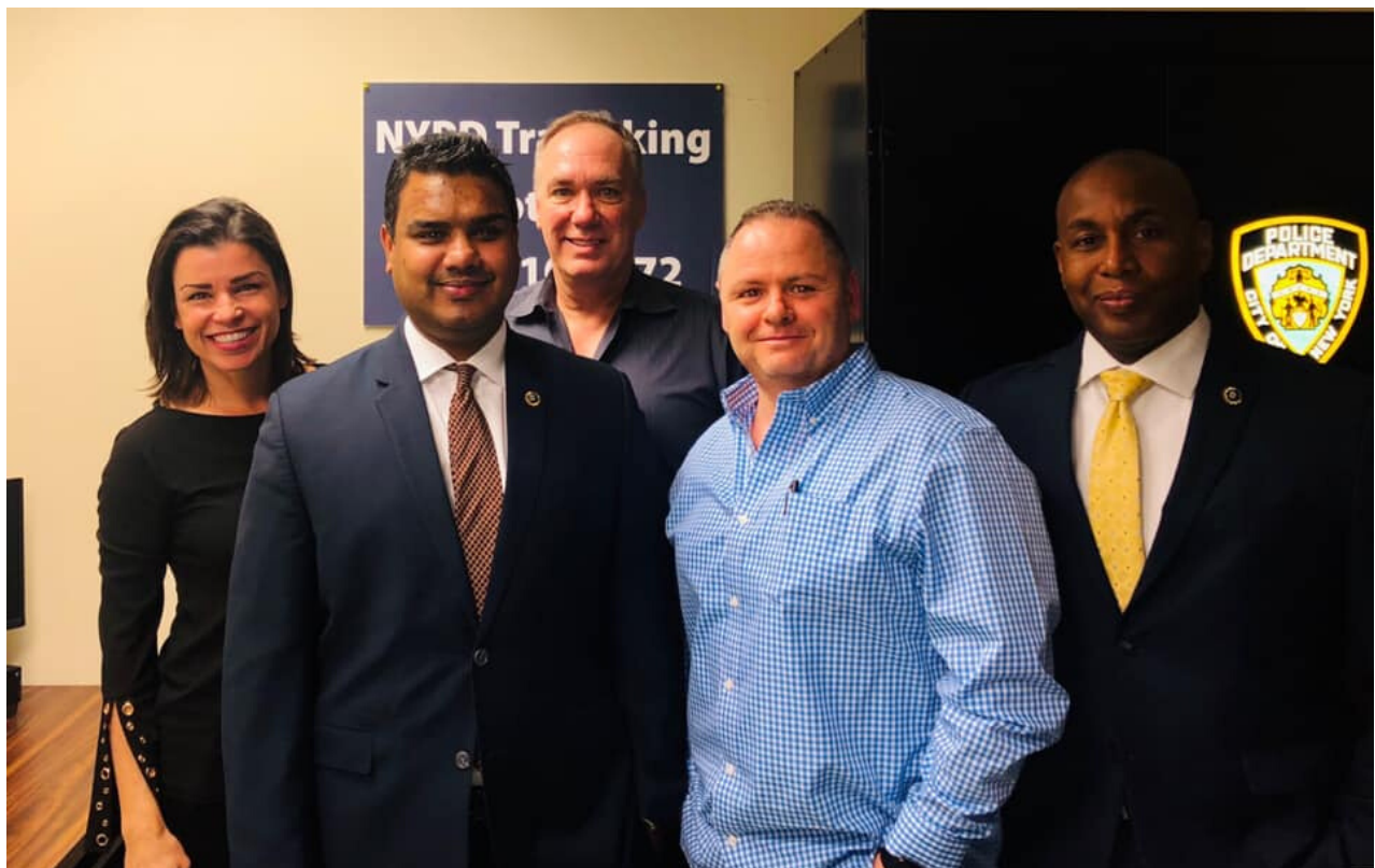
Above: The Selah Way Foundation was honored to unite with NYPD Vice through our Protection Initiative training.